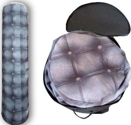
High resolution fabric printed using dye sublimation