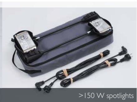
>150 W spotlights